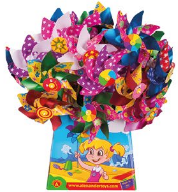
SMALL DISPLAY 32 & 40 pcs