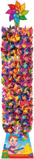
XL DISPLAY 192 pcs