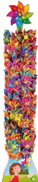
LARGE DISPLAY 136 pcs